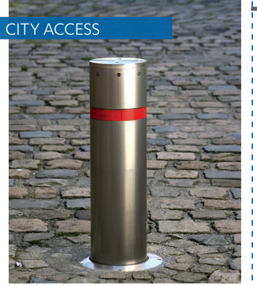
Bollard, perimeter access, traffic management