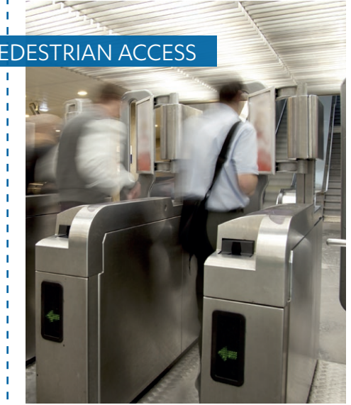
cubway, railway & airport swing gates, turnstiles

We are constantly recognizing these needs and converting them into new product innovations to be used in many applications.